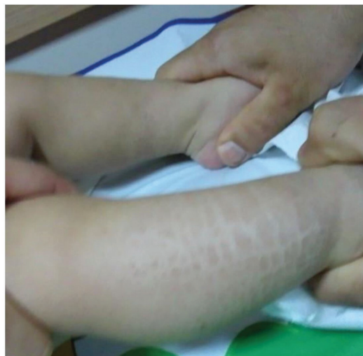
Figure 2. Ichthyotic plaques on the extensor surfaces of the lower extremities of one of the babies.

Prenatal USG was normal in all the cases. The cases we could not contact after pregnancy were uneventful